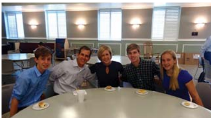
Sausage Sunday A December Tradition

Bring the whole family and your neighbors and/or friends and explore the stories and symbols of Lent followed by a lasagna dinner.