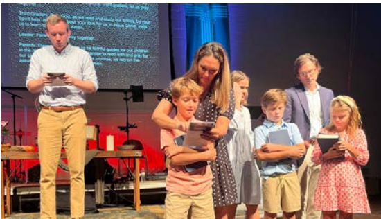
3rd Grade Bible Presentation at the Connection Service