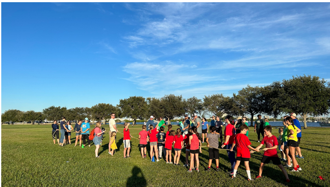
All-Church Field Day