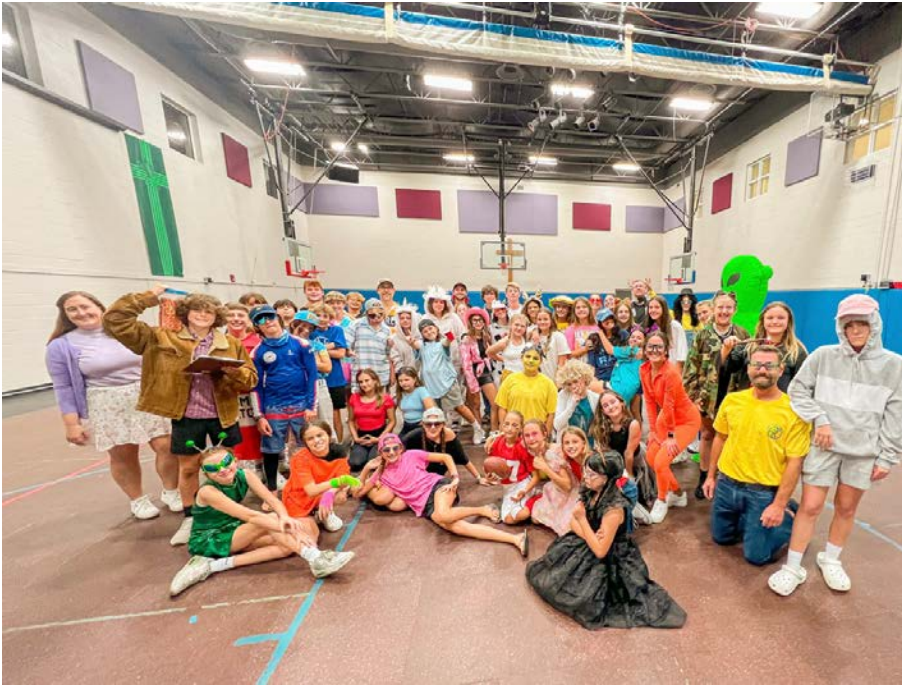
PCPC Middle School Halloween Costume Party

We've connected with well over a hundred different youth this year and our ministry programs are vibrant and healthy. We love every opportunity we have to connect our students to God and each other. PCPC Youth spent over 2,000 hours participating in volunteer work in 2023 partnering with both local and national organizations.