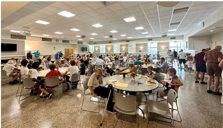
Wednesday Night Dinner regularly served more than 200 meals each week