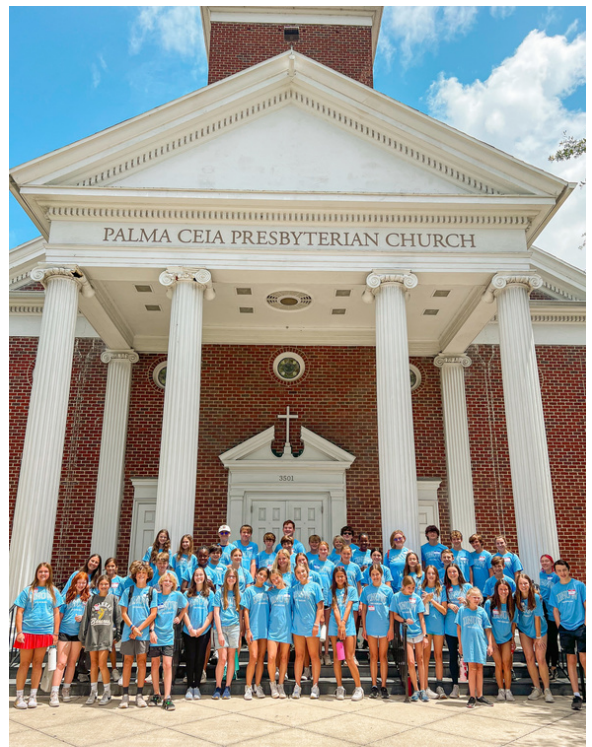
Middle School Disciple Now Service Week