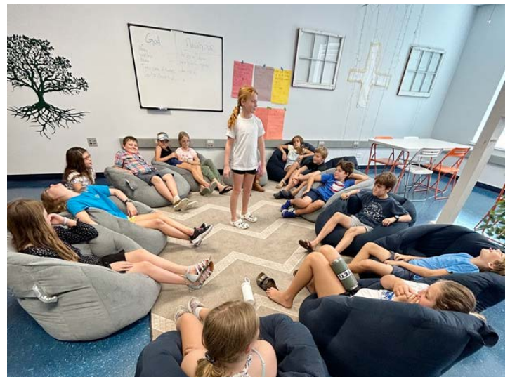
Justice Seekers learning about Matthew 25 and playing a game