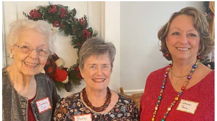
Presbyterian Women's Christmas Coffee was enjoyed by over 40 women