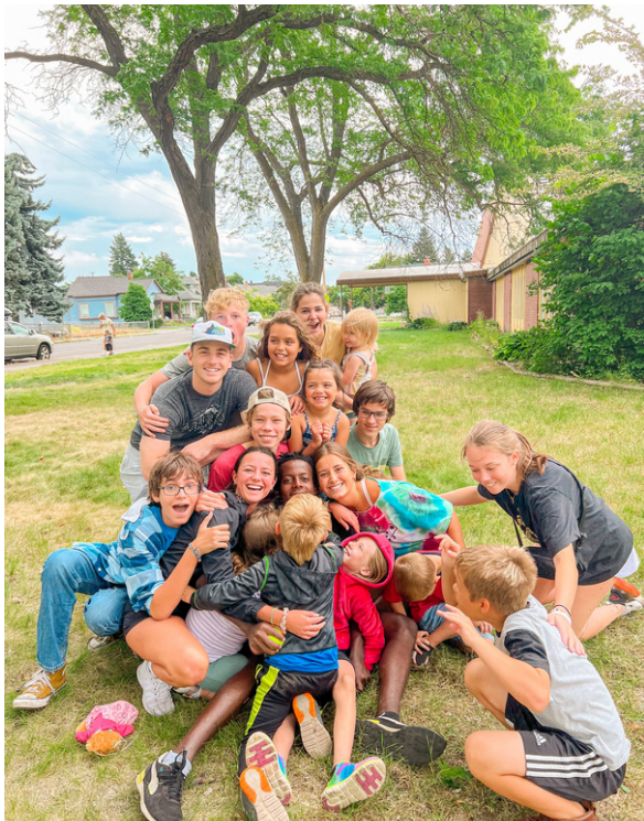
High school Service Trip to Spokane, Washington