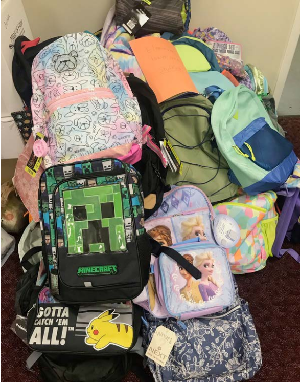
Annual School Supply drive supported many local students