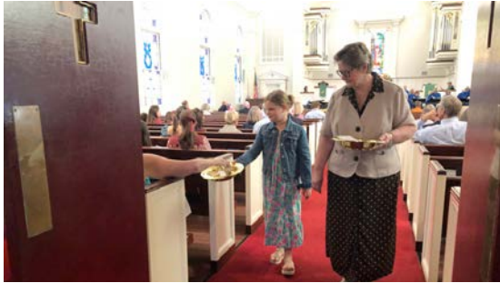
Increase of children participating in worship leadership