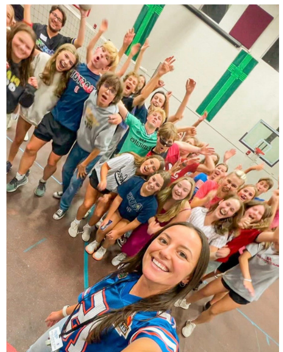
High School Youth Group