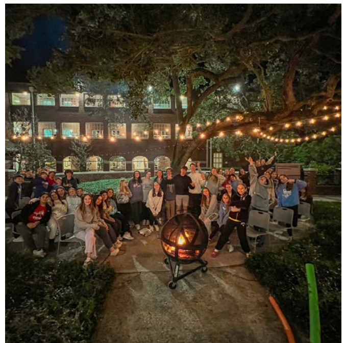
Youth Experiential Worship Stations