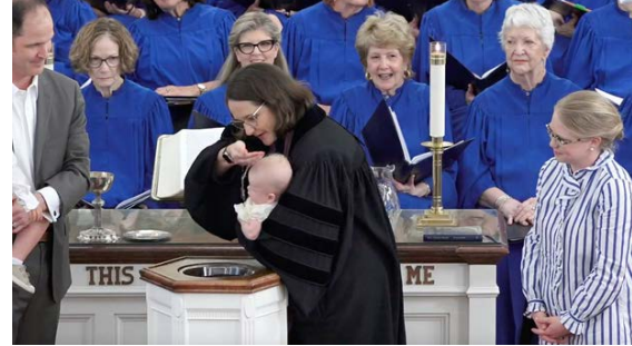
Baptism in the Sanctuary