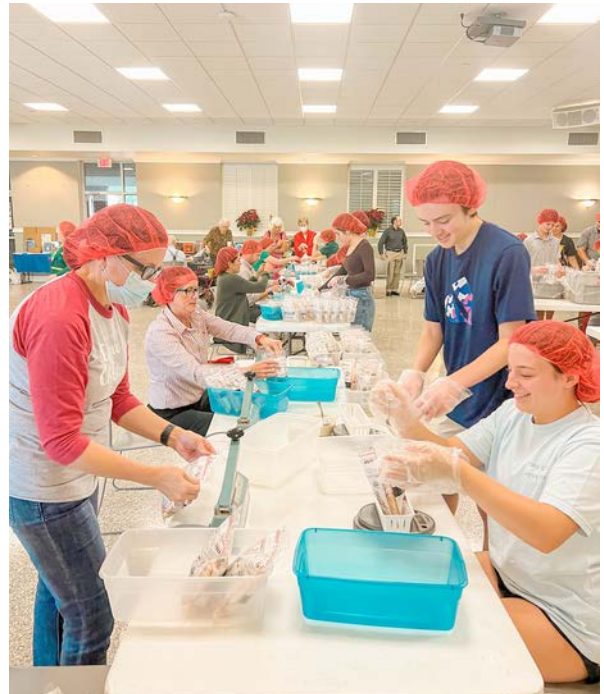
10,110 meals packed for Rise Against Hunger