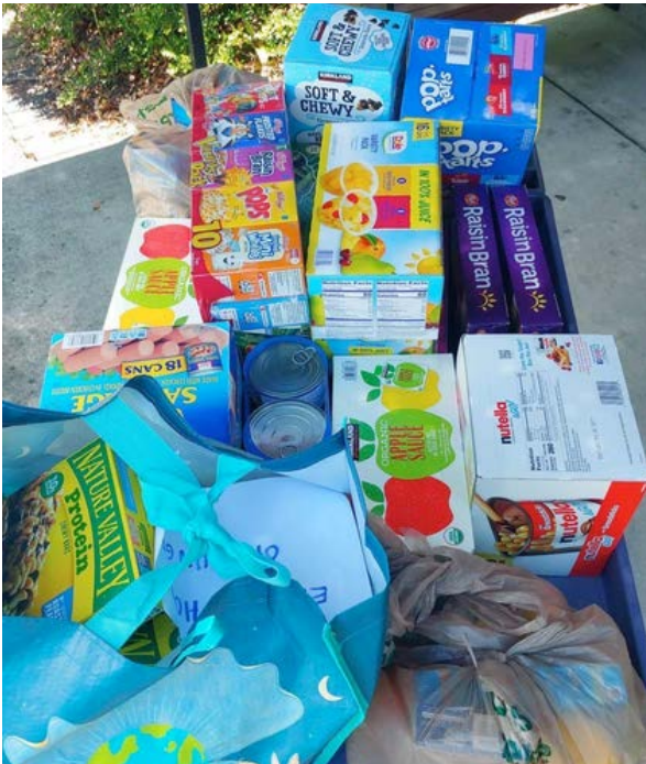
Food drives were held and supported our ministry partners at Beth-El Farmworker Ministry and End 68 Hours of Hunger.