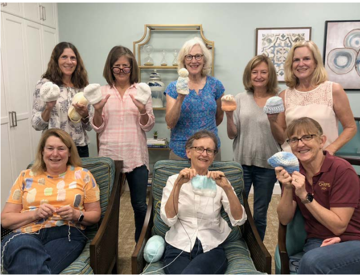
PW knitting group provided many babycaps to TGH