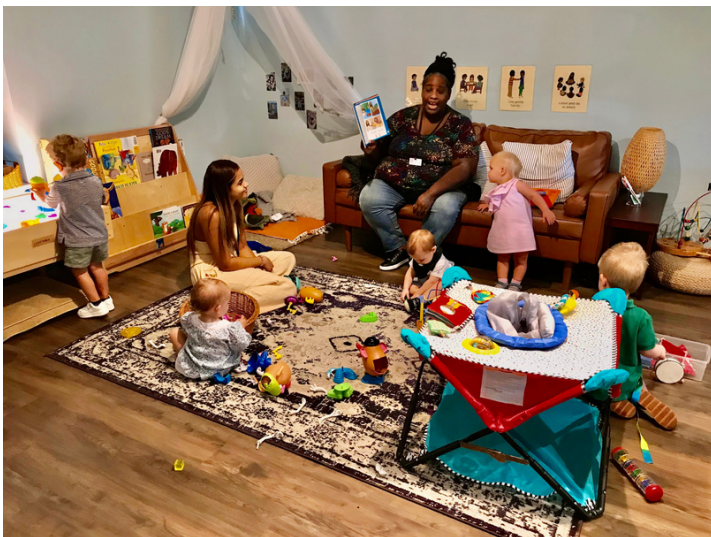
Nursery lesson on baby Moses in a basket