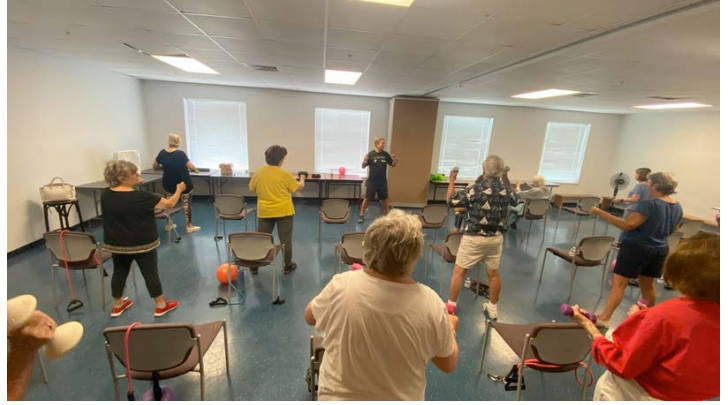
Silver Fitness and Tai Chi met weekly