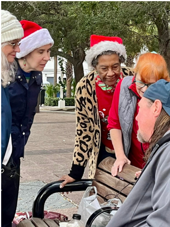
Kindness Matters extends love and supplies to the unhoused in downtown Tampa