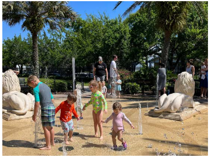
Splash Day Baptism Anniversary Celebration at Kate Jackson Park