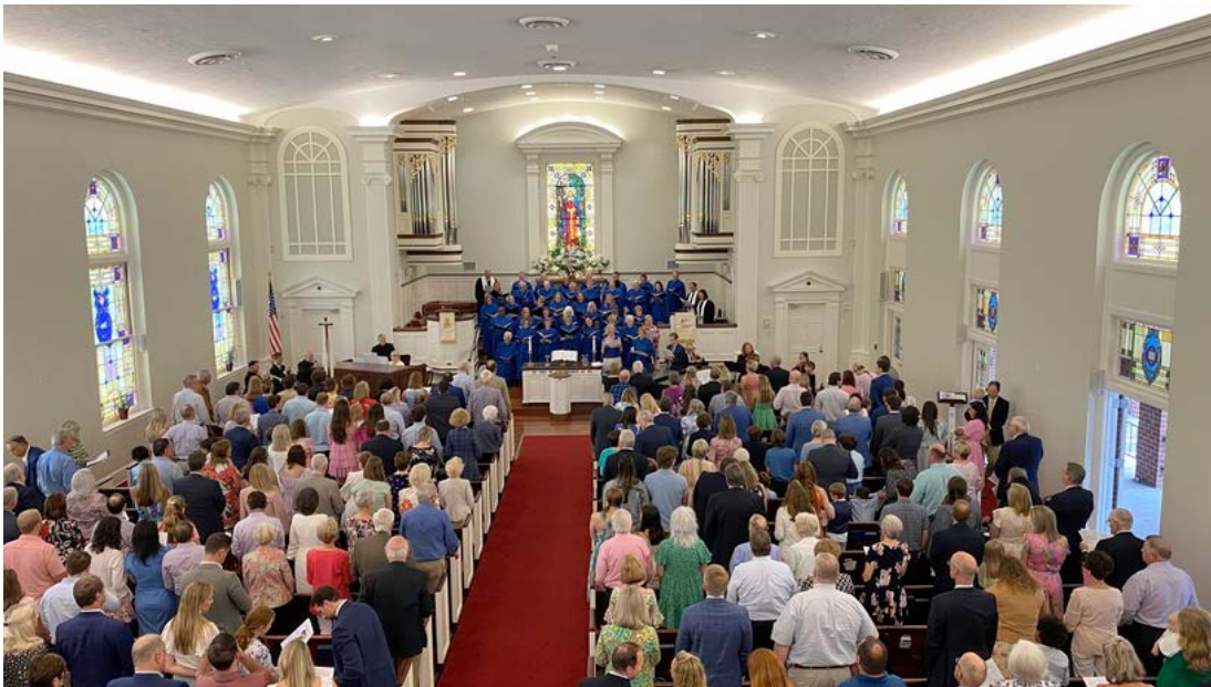
Easter Sunday. Worship attendance began to consistently be at least 75% of what we were seeing pre-pandemic.