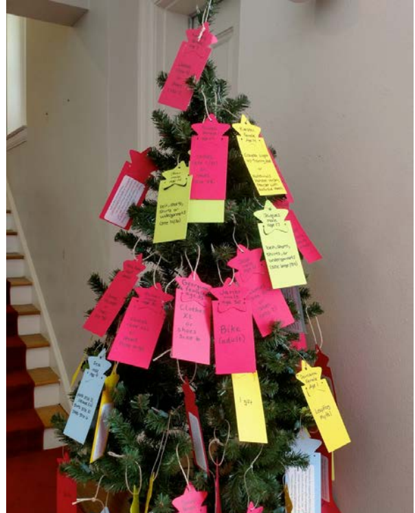
275 Giving Tree gifts went to 120 people at Christmas