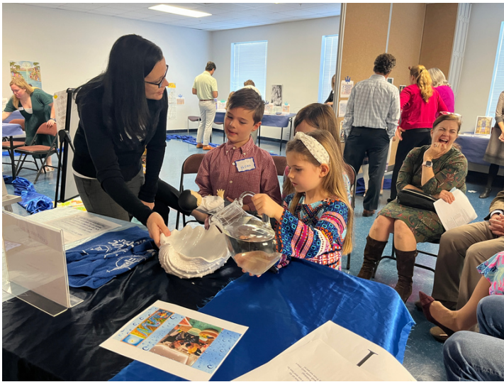
Touch the Water with 1st Graders: Remember Your Baptism