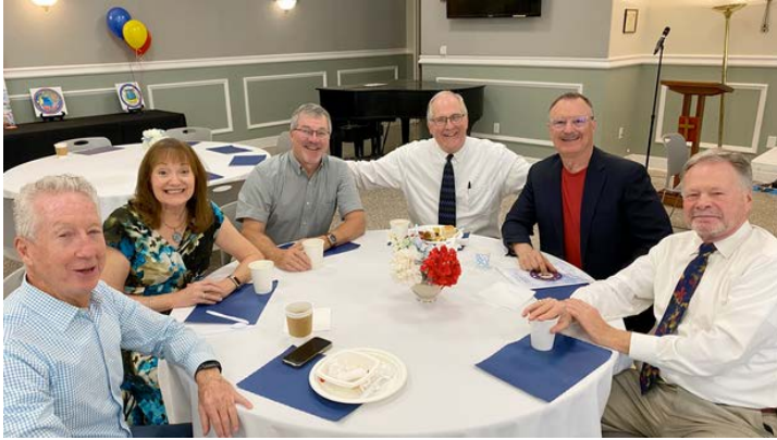
Stewardship Lunch celebrating a successful campaign