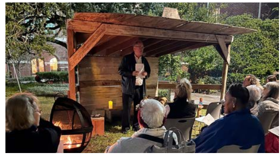
The Longest Night Service, remembering those in Hillsborough County who died while experiencing homelessness