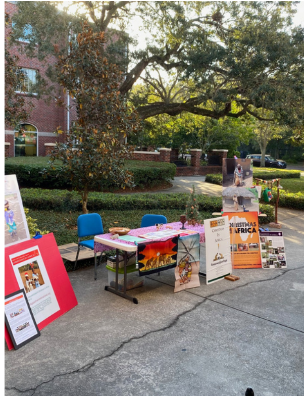
Christmas in Africa expanded into Christmas Around the World