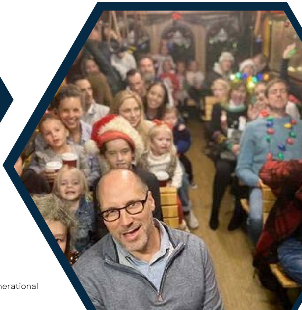
The Jolly Trolley is intergenerational fun each Advent!

PCPC’s mission is to be a Christian community, to witness to God’s love by being a community of disciples of Jesus Christ, scripturally centered, joyfully and prayerfully in fellowship, with a heritage in the Reformed tradition, offering regular opportunities for worship with excellence in preaching and music, woven through education and nurture, marked by hospitality, humility, and compassion, expressed through friendship and service, locally and globally. Out of our family history, our mission is particularly to be a Christian community valuing children and youth, and to be a neighborhood church with friendships around the world.