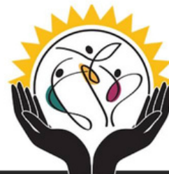
PCPC continued its support of refugees in the Tampa Bay area

For your generosity and support of refugee and migrant women as they resettle in the Tampa Bay area