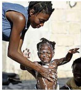
A quake survivor in Haiti bathes her child.