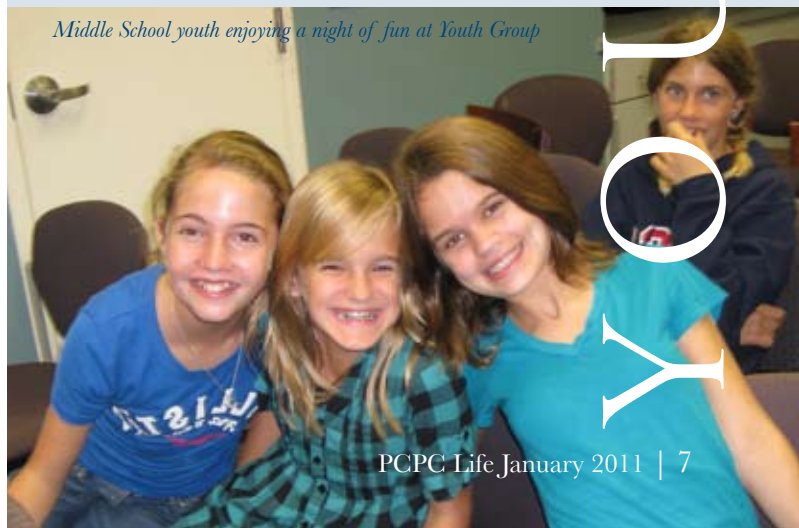
Middle School youth enjoying a night of fun at Youth Group

Sign up by dropping off a check for $50 to the church office by January 14.